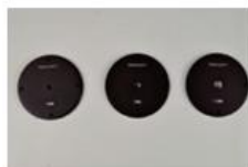
▲ Custom Made Apertures