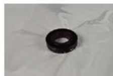
▲ Soft Film Fixture