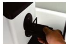
▲ Liquid/ Sheet Material Fixture