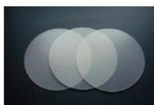
▲ Plastic Sheet