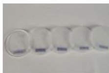
▲ Haze Standards