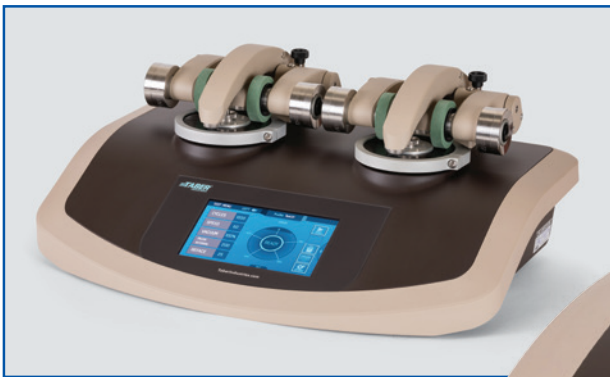
MODEL 1750 DUAL PLATFORM ABRASER