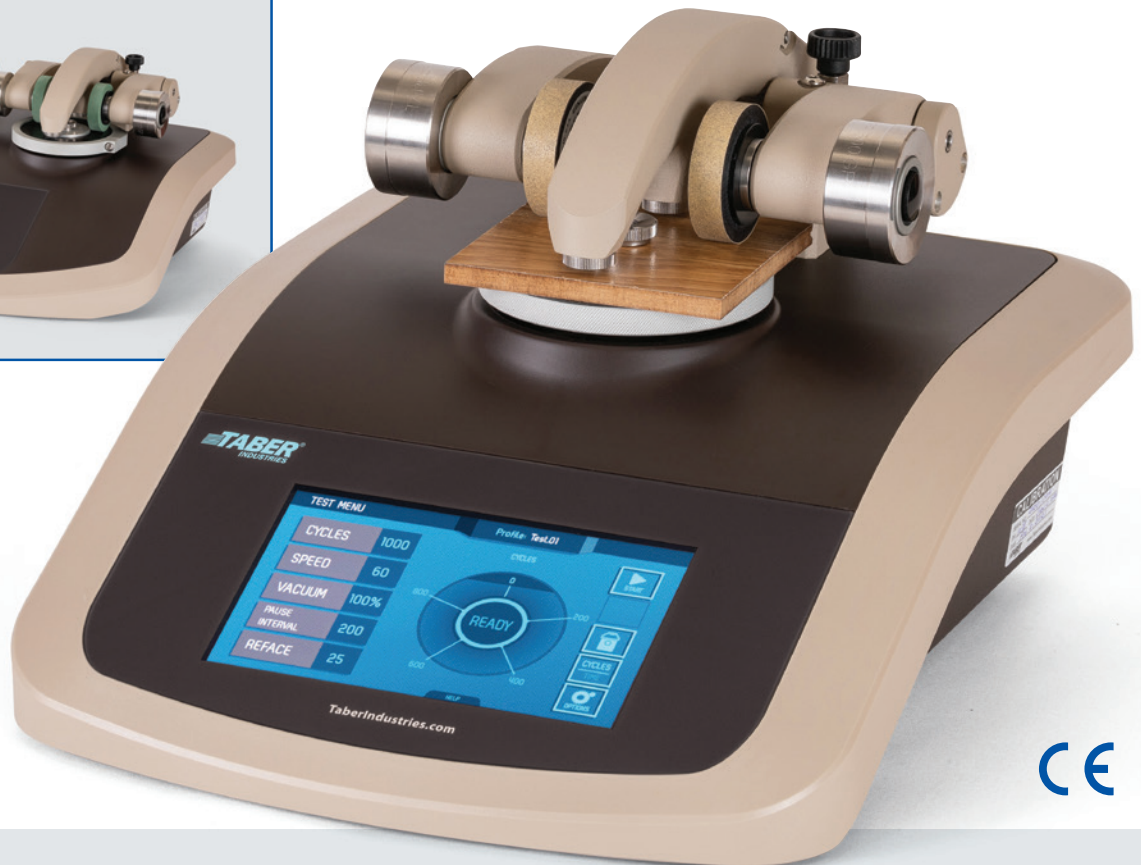
MODEL 1700 SINGLE PLATFORM ABRASER