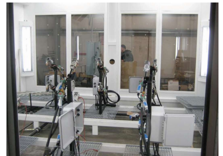
Modular Burn Chamber Left: Outside (back) view Right: Inside view, toward windows